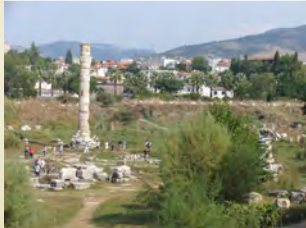
One of the Seven Wonders of the Ancient World!