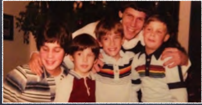
Big Photo: Joy